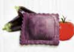
RAVIOLI OF AUBERGINE AND TOMATO