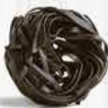
TAGLIATELLE NERO DI SÍPIA