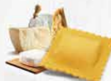
RAVIOLI 4 CHEESES