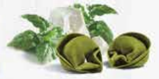
TORTELLINI RICOTA AND SPINACH