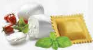
RAVIOLI WITH MOZZARELLA, TOMATO AND BASIL