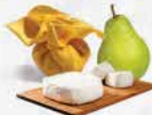
FAGOTTINI PEAR AND GORGONZOLA