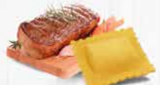
RAVIOLI GRILLED MEAT